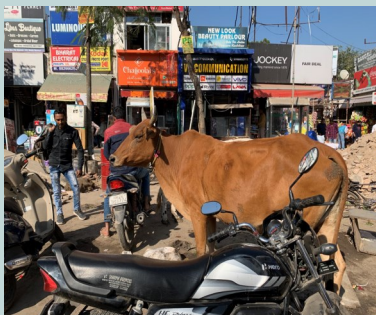
No report on India is complete without this picture of peaceful coexistence